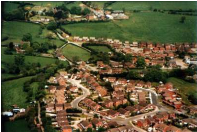
Fulford in 1988