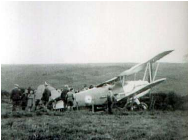
This is the Prince of Wales plane that crash landed in the field behind Fulford County School.

summon help. A policeman kept guard of the plane that night.