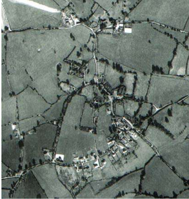
An aerial view of Fulford as it was in 1971