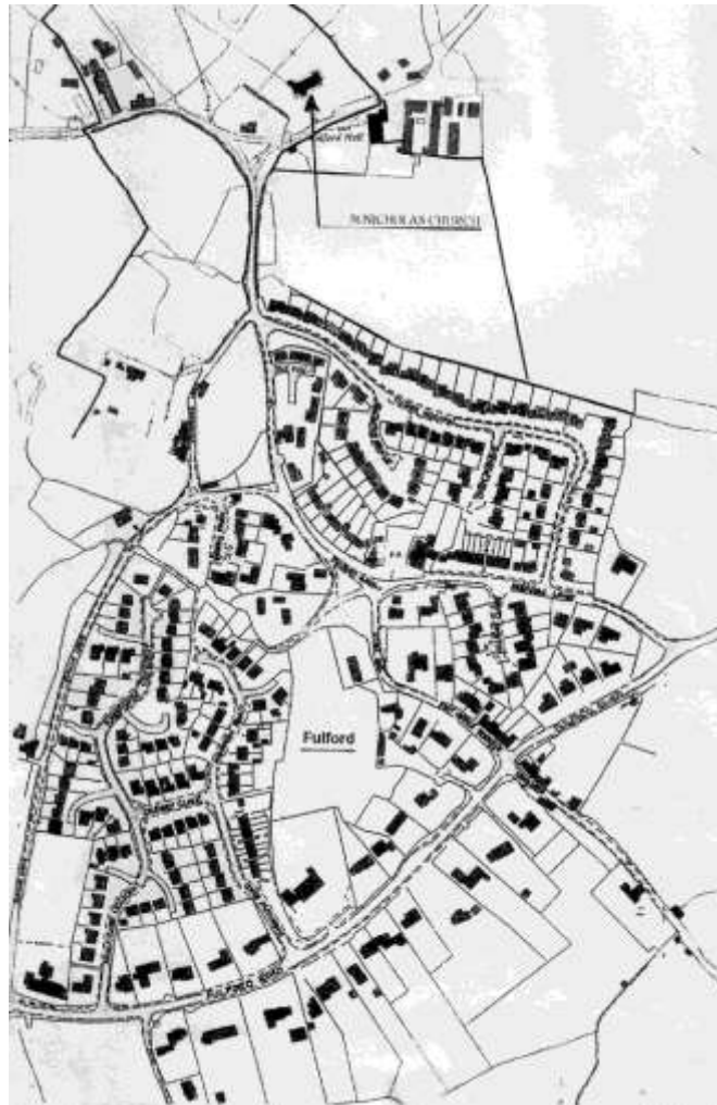
This map of Fulford in 2006 was produced by the author and is based on the 1849 tithe map, the aerial photograph, and lots of footwork. It shows how the village now comprises almost 300 dwellings, about ten-times more than in 1901.