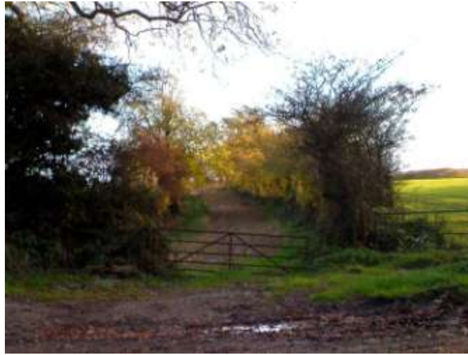
Looking down between the hedges that border Summer Street Lane in 2006 *

then taken into York for burial. He was thirty-four years old.