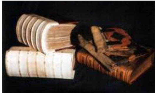
The Domesday Book

Fulford village stands on one of the tributaries of the River Blythe to the south of the route of the old Roman Road that passed through Draycott and Blythe Bridge and on to the Stoke boundary.