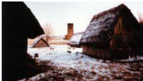
Fulford may have looked like this in 1086

At the time of the Domesday Book of 1086 there were only about 3,000 people living in Staffordshire, or 'Stadfordscire' as it was called, and Fulford was known as 'Foleford', literally meaning " foul or dirty ford ", or " full ford " according to some modern scholars. The actual settlement of Fulford consisted of one virgate of land ( about 30 acres ) which was held by the Anglo-Saxon Almar, the last Earl of the Royal House of Mercia, and there was land for two ploughs, the remainder of the land being divided amongst the few inhabitants of the village. Their rough timber and thatch houses would have been built at random within an earthen wall or ditch, and would probably have been quite small and simple with sunken floors. Almar would have lived in one of them and would also have had a home farm and a team of about eight oxen. The other houses would have been occupied by villeins , or unfree tenants, who probably had one or perhaps two oxen each and a few acres of arable land, given on the understanding that they ploughed the Lord's land in the spring and provided oxen for the Lord's plough team. In addition each of them would have had to undertake to work for the Lord of the Manor for three days a week, or pay a yearly toll.