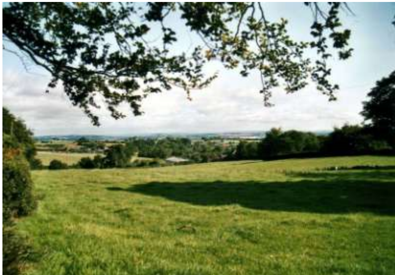
Looking down on the village green area of Fulford and the church, both hidden in the trees. *

The copyright ownership of this photograph is held by Airpic Ltd. of Harpenden. Permission to reproduce it is still being sought.