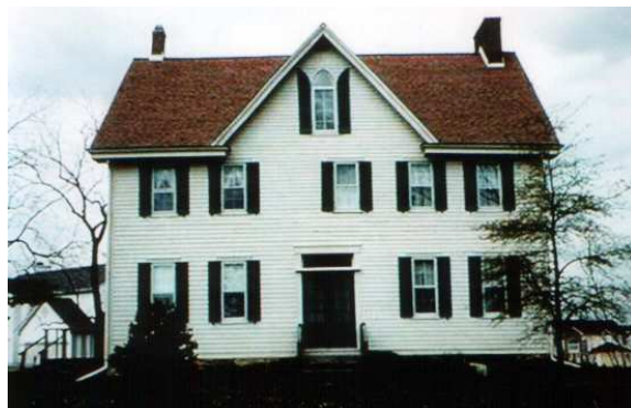
The Homestead at Waterford Township