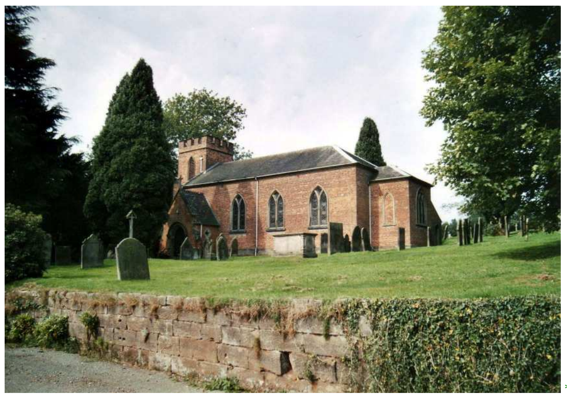
St. Nicholas Church in 2006