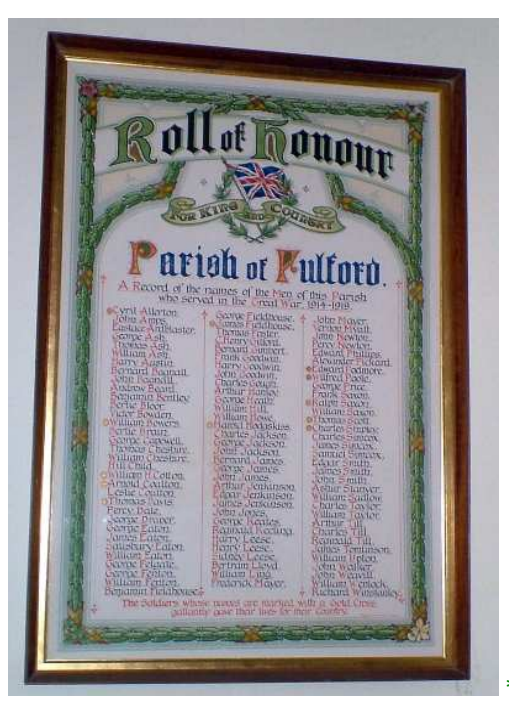
The stone calvary and roll of honour dedicated to the men of Fulford who lost their lives in the Great War