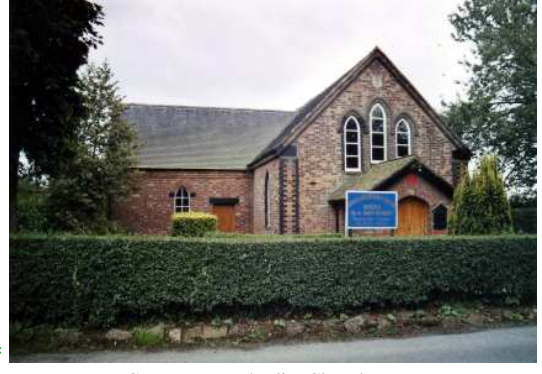
The old Calvanistic Chapel on the right