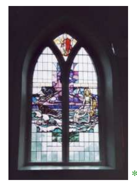
The Mersh family memorial window