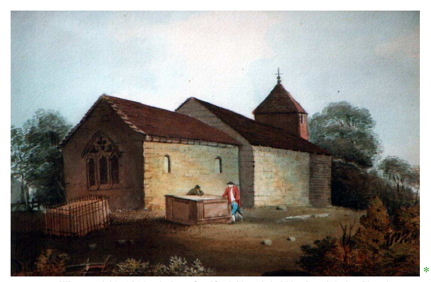
William Walsh's 1814 painting of Fulford Chapel, held by St. Nicholas Church

From the painting that William Walsh did of the old Chapel in 1814 it would appear that the Chapel was built in about the 13<sup>th</sup> century and that it was built using Keuper 'white' sandstone that had been quarried behind Fulford Manor Farm for centuries. It measured approximately 14 metres by 10 metres and is shown as being of mixed architectural styles, with the east window being Early English and the two tiny side windows appearing to be Norman.