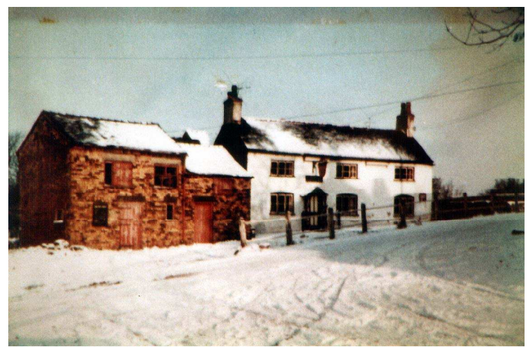
The Shoulder of Mutton with the stable and cow shed to the left

The Shoulder of Mutton was originally a simple rectangular two-story brick farm and ale house with a slate roof, though the front and back of the building have been much modified over the years. Originally there were two rooms open to the public, a small snug where the men sat and played cards, and a larger room that was often used for dances. Both rooms have oak beams across low ceilings. Overnight accommodation was provided for travellers.