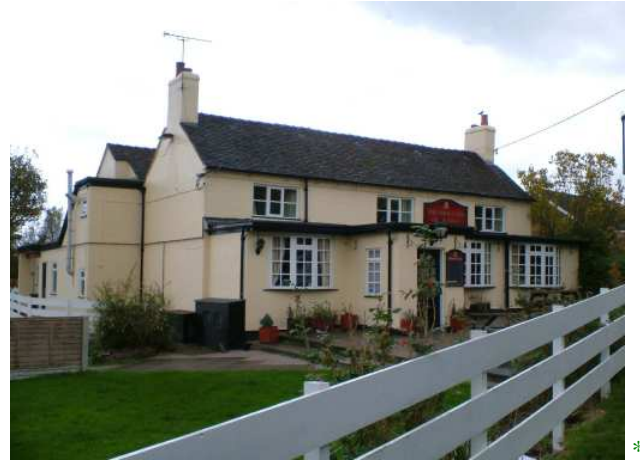
The Shoulder of Mutton in 2000

The Mother's Union also held their meetings in the Shoulder of Mutton in the 1950's, in the large room on the right-hand side of the building. High Tea was also taken.