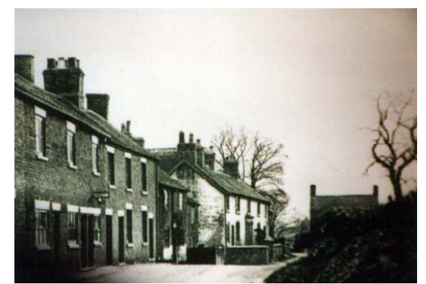
Post Office Terrace with the Post Office sign to be seen above the Post Office door. The low, dark building at the end of the row of buildings was the smithy and the white building across the road was Fulford House Farm.

Terrace in the Townend area of Fulford. Post Office Terrace is a relatively new name for what was once known as Long Lane End. Before that it was known as Summer Street Lane and legend has it that Dick Turpin rode here in 1739 as he fled from London to try to escape capture. The building at the Fulford Road end of the cottages was one of the two smithies in the village and belonged to blacksmith Edwin Fenton between 1860 and 1896.