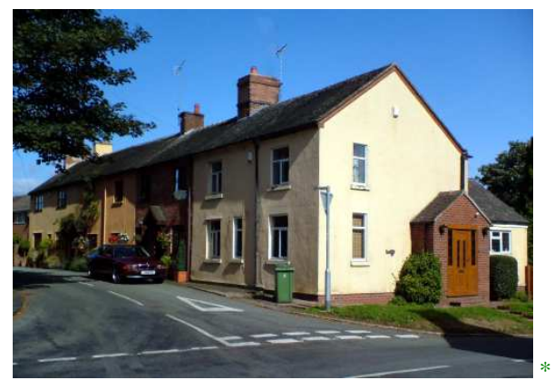
Post Office Terrace from the opposite end in 2006.

Among the past post-masters and post-mistresses at this post office were:-