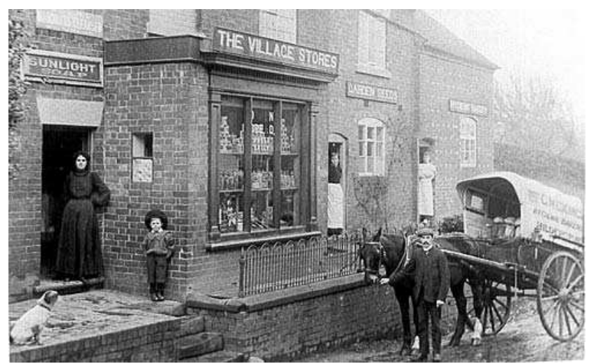
Hilderstone village stores Approval to use the photograph is still to be sought from Staffordshire Past Track